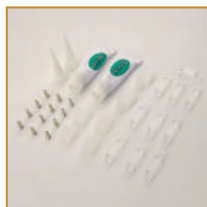
Zestaw akcesoriów do Taśm IP67 / 10mm Accessories SET for IP67 LED Strips / 10 mm