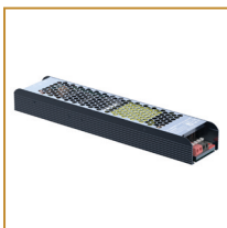
Zasilacz modułowy Blue 150W Modular power supply Blue 150W