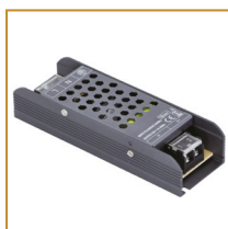
Zasilacz modułowy Graphite 100W Modular power supply Graphite 100W