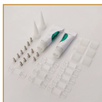
Zestaw akcesoriów do Taśm IP67 / 10mm Accessories SET for IP67 LED Strips / 10 mm