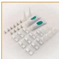
Zestaw akcesoriów do NEONU LED FLEX 3D 8x8 Accessories SET for NEON LED FLEX 3D 8x8