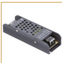
Zasilacz modułowy Graphite 100W Modular power supply Graphite 100W