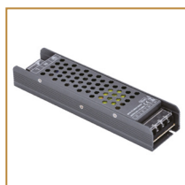
Zasilacz modułowy Graphite 150W Modular power supply Graphite 150W