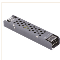
Zasilacz modułowy Graphite 60W Modular power supply Graphite 60W