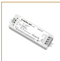
Sterownik do taśm jednokolorowych Single colour LED strips controller