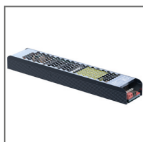
Zasilacz modułowy BLUE 400W Modular power supply BLUE 400W