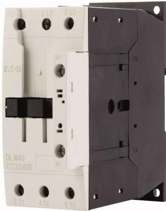
Contactor (DIL Frame 3 DC)