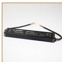
Zasilacz LLG 150W wodoodporny NExtec power supply LLG 150W