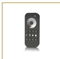
Pilot do taśm jednokolorowych Remote controller for single colour LED strips