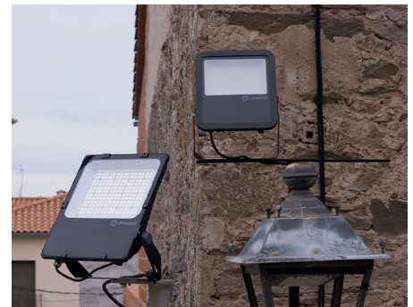
IP66 and IK08 protection for robustness