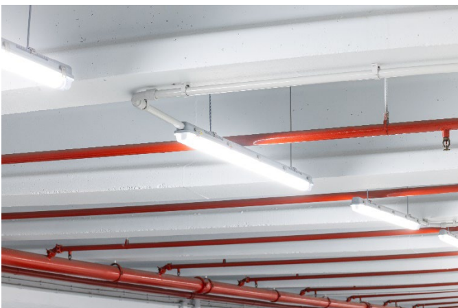
DALI compatible LED T8 tubes allow for more efficient control and monitoring