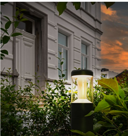
In outdoor lighting, Endura Style Lantern Bollards were used in many places.

The lighting project, developed by LEDVANCE together with the owner and Architect, has played an essential role in highlighting the architectural splendor of the Wevers Huis. The interior is illuminated with Classic B 40 DIM E14 lamps for the beautiful chandeliers that adorn the various rooms. A particular highlight can be found in the entrance hall with LEDVANCE Linear Individed Everloop, specially mounted as a light line for this project. This provides both direct and indirect warm white light, impressively accentuating the central corridor and highlighting the monumental character of the building immediately upon entering. Residential fixtures such as Decor Tokyo Table, Planon Frameless fixtures for the ceilings, Panan Alu as desk lighting and recessed spotlights Darklight Fix were also used in the various spaces. In outdoor lighting, Endura Style Lantern Bollards were used in many places.