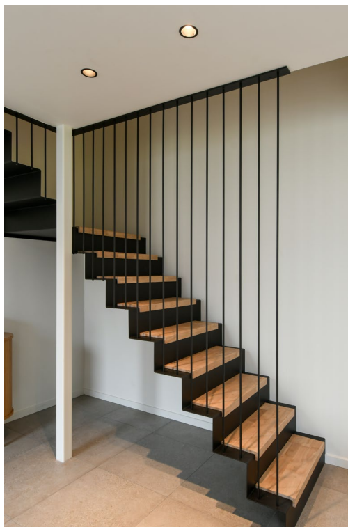
The recessed spotlights Darklight Fix were used in multiple rooms

Through a combination of solutions from LEDVANCE's professional and residential ranges, and in close collaboration with a renowned interior designer, various lighting solutions have been implemented that perfectly match the chosen style and respects the design of this historical building from 1880 as best of both worlds.