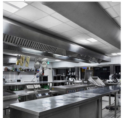
Kitchen with 32 Panel Protect luminaires delivering low-glare, adjustable light ideal for daily professional operations.