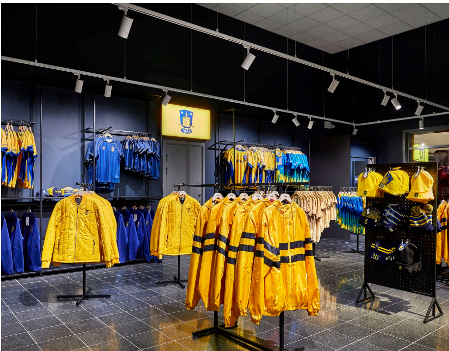
Fan shop with 25 Tracklight Spot Zoom Dim luminaires delivering precise zoom and high-CRI lighting to present merchandise at its best.