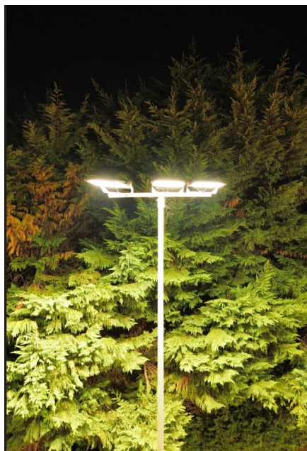
Precision lighting on the tennis courts means players can fully focus on their rallies.

and a 5-year warranty, the long-term effort and costs for maintaining the LED luminaires are minimised.